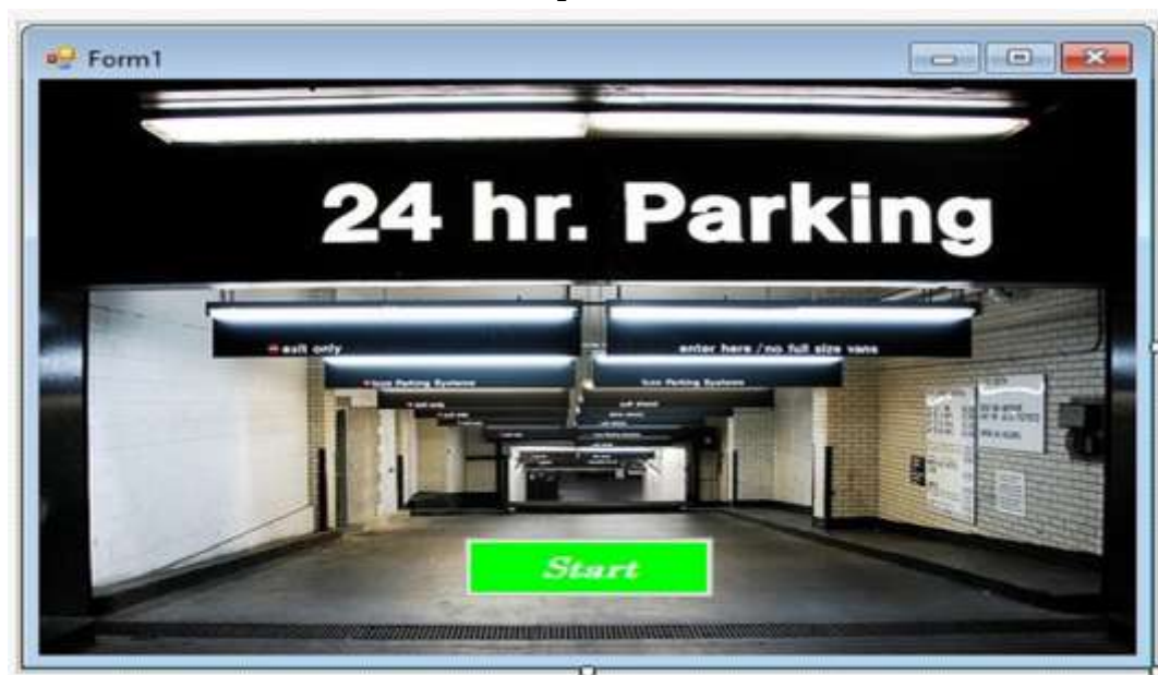
Fig 2.Starting window